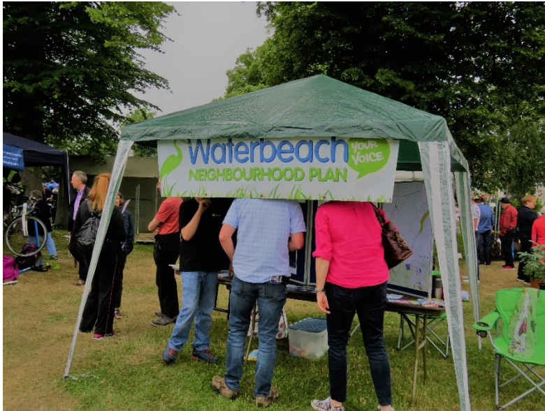
Figure 1: Waterbeach Feast - June 2017