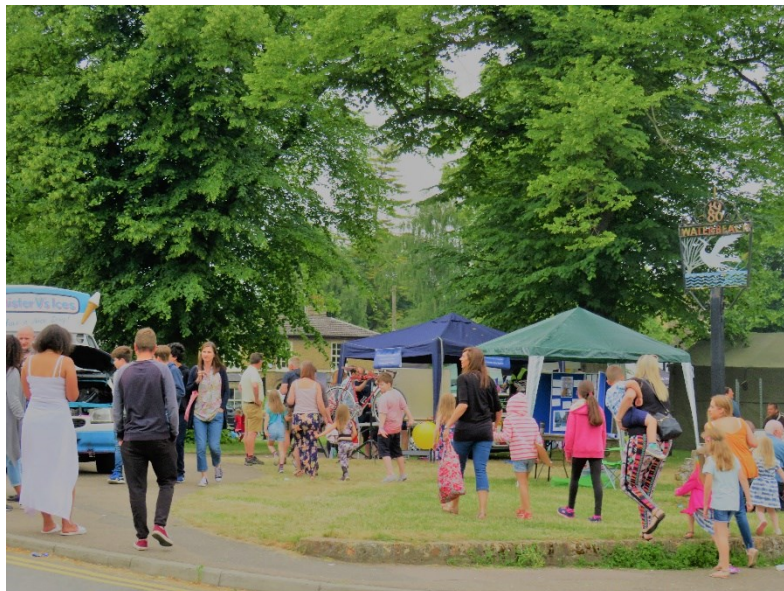
Figure 2: Waterbeach Feast - June 2017